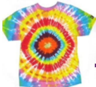
THE BIG BANG

...that will show your kids you did waaaay too much acid in the '70s!