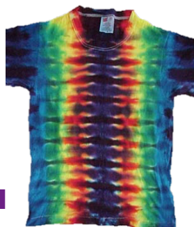
THE CENTRAL PATH

"Plain and simple, kids: I send you to Sunday school each weekend, but the truth is that I've seen God before. It was in a meadow outside of San Francisco. I had just picked some mushrooms out of the ground, and let's just say that while Jesus has one halo in all those old Renaissance paintings, I had three halos , and it looked just like this shirt. So yeah, you kids might make fun of me to your friends, but trust me—I used to be more badass in the eyes of God than Jesus ever was."