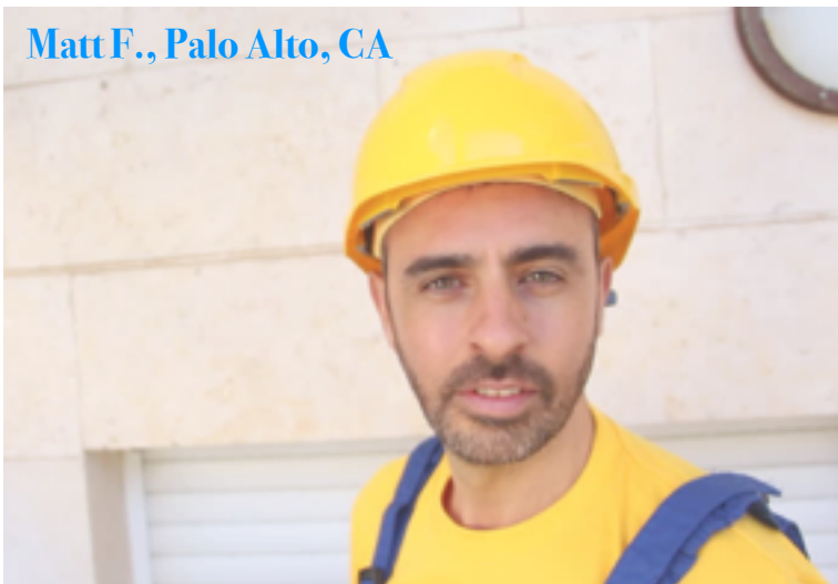
“Hmm... can't really think of anything, sorry!”