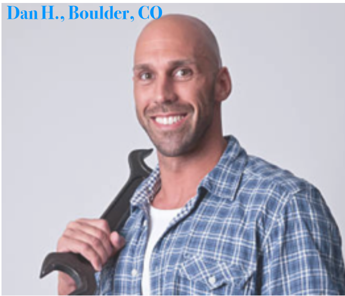
“This question offends me.”